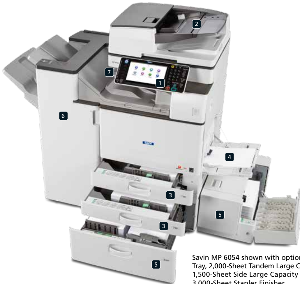
Savin MP 6054 shown with optional One-Bin Tray, 2,000-Sheet Tandem Large Capacity Tray, 1,500-Sheet Side Large Capacity Tray and 3,000-Sheet Stapler Finisher.